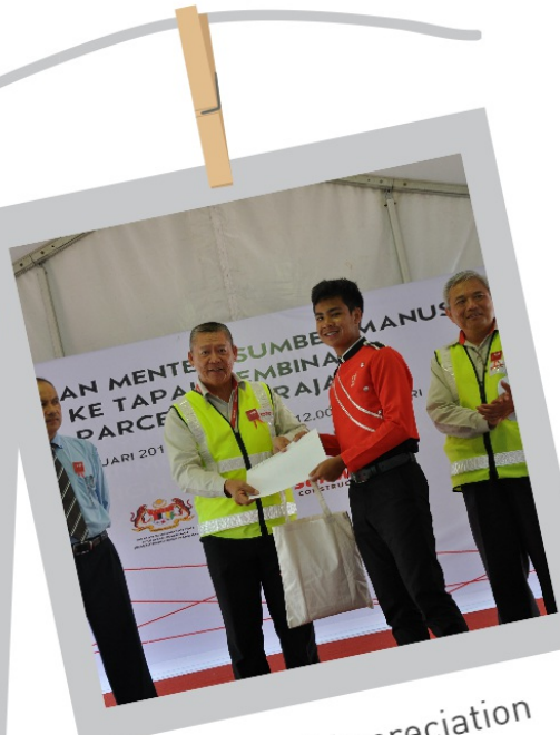
Token of Appreciation Presentation