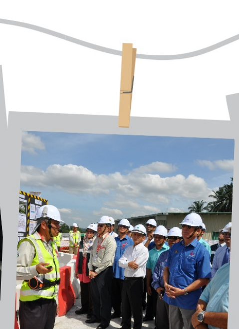
Site Walk with the Minister