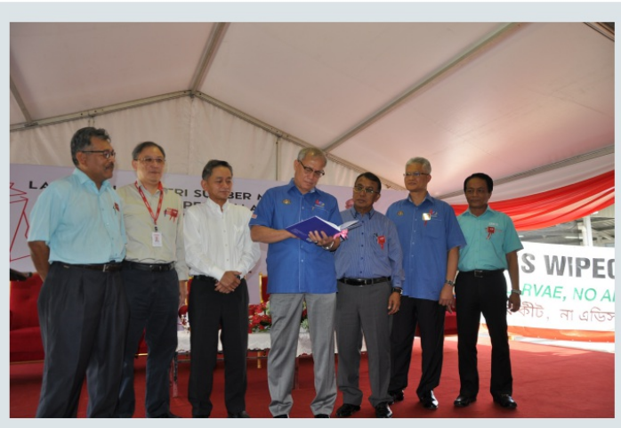
Launch of Guidelines on Occupational Safety and Health in Construction Industry (Management) 2017 by YB Dato' Sri Richard Riot